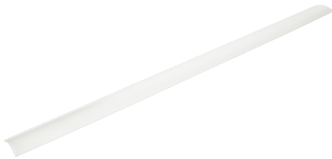
Order Code: LNS0008 Frosted smooth acrylic lens diffuser